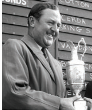
Bobby Locke 1952