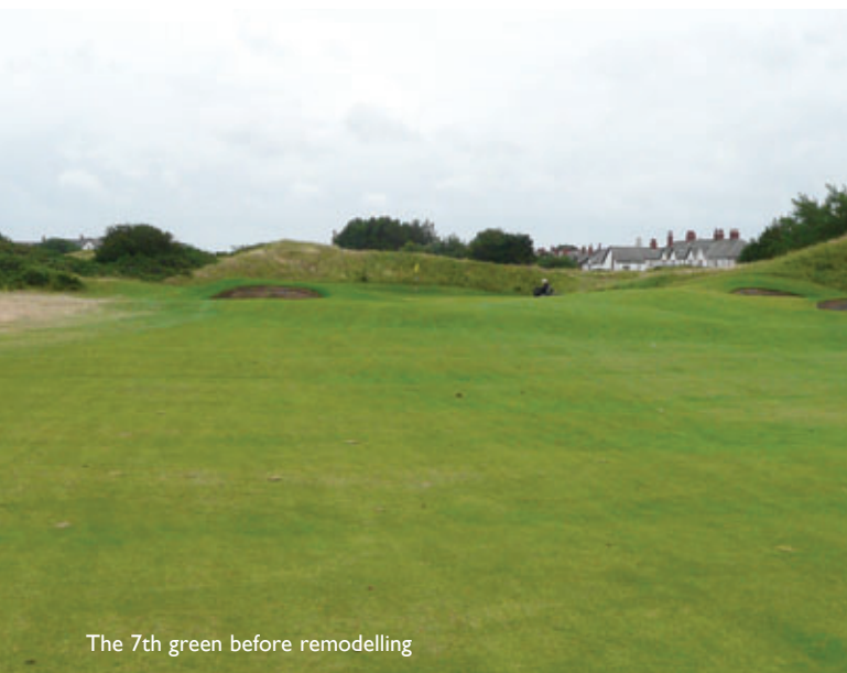
The 7th green before remodelling

Prior to the return of the Open Championship to Lytham in 2012, limited remodelling of some areas of the course has been done to maintain the challenge of the course to the elite golfer. New dune forms have been created along the 2nd, 3rd, 7th and 16th holes, some new bunkers and swales have been introduced, and the 7th green has been repositioned. All the physical re-shaping has worked very well, but is surpassed by the quality of the planting which has been done on these modified landforms, making them indistinguishable from natural environments. The re-modelled areas have been re-planted with marram and other characteristic dune grasses and have rapidly melded with the surrounding areas. This is an outstanding example of how sensitive design, founded on a strong awareness of the natural landscapes and combined with thoughtful selection of species for re-planting, can result in high quality habitats and landforms.