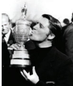
Gary Player 1974