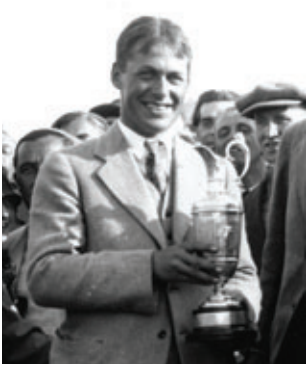
Bobby Jones (A) 1926