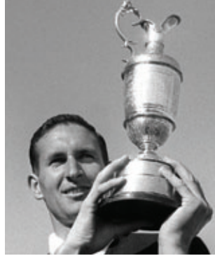
Bob Charles 1963