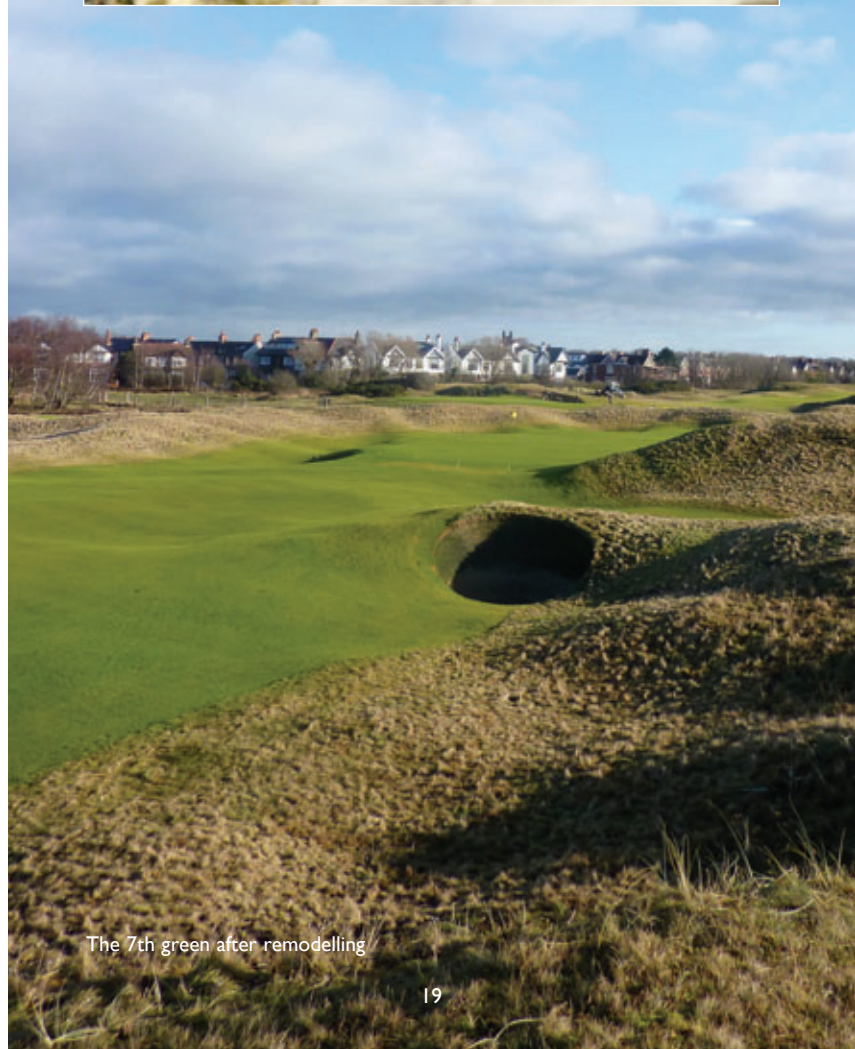
The 7th green after remodelling