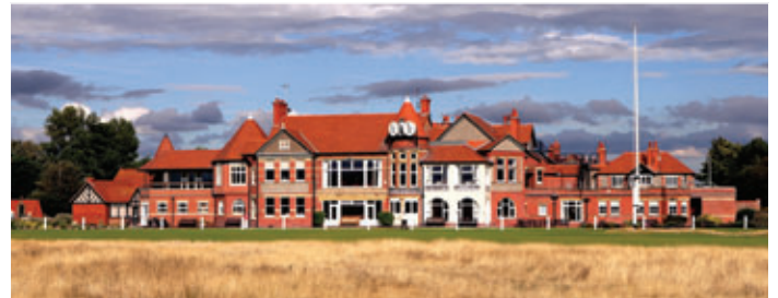
Royal Liverpool 17-20 July 2014