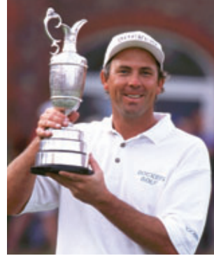
Tom Lehman 1996