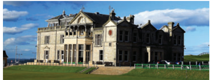
St Andrews 16-19 July 2015