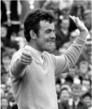
Tony Jacklin 1969