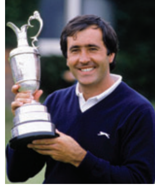
Seve Ballesteros 1979 and 1988