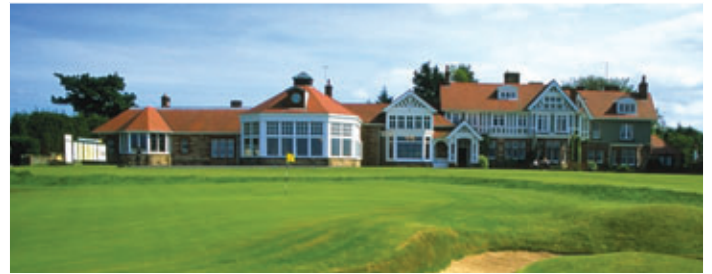
Muirfield 18-21 July 2013